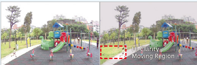
Without Smart Stream II