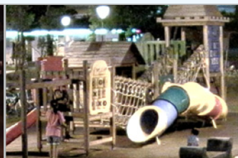
VIVOTEK SNV Camera